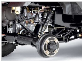
Strength and comfort