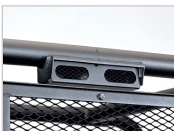
Clean, cool air