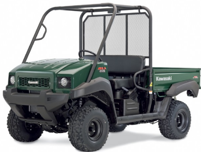
Model Year 2009