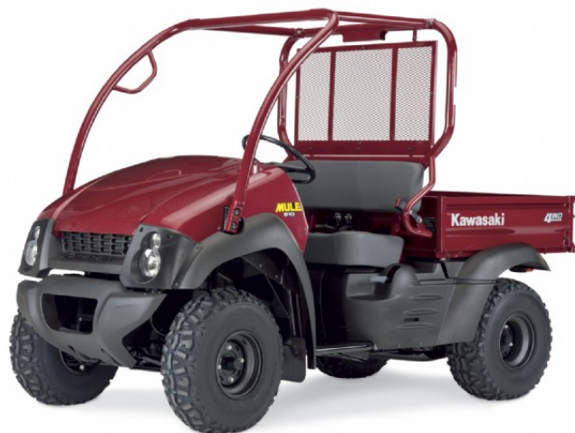
Model Year 2009