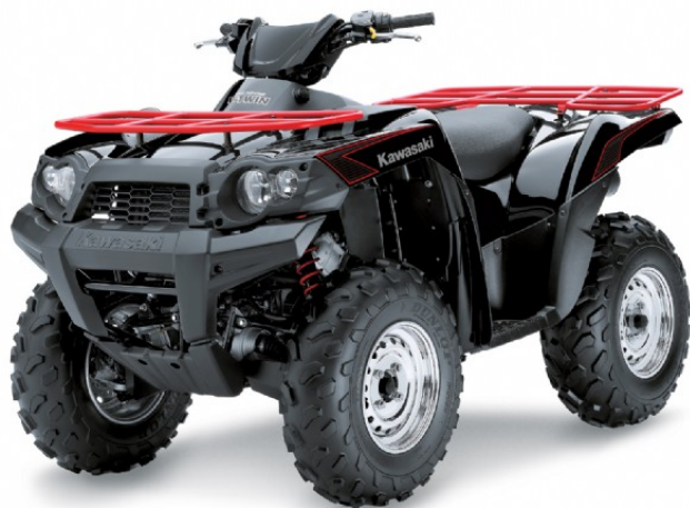
Model Year 2009