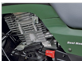
Dual Mode differential