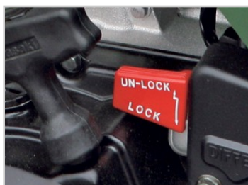
DUAL MODE DIFFERENTIAL